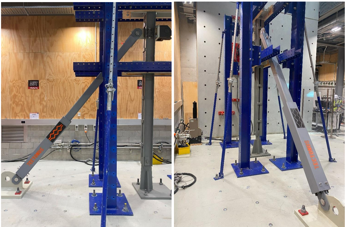
Dynamic testing of Tectonus DMAX brace with a capacity of 310kN